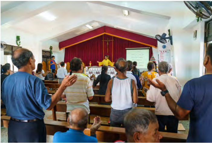
Men and women worship God at a church in Taiwan.