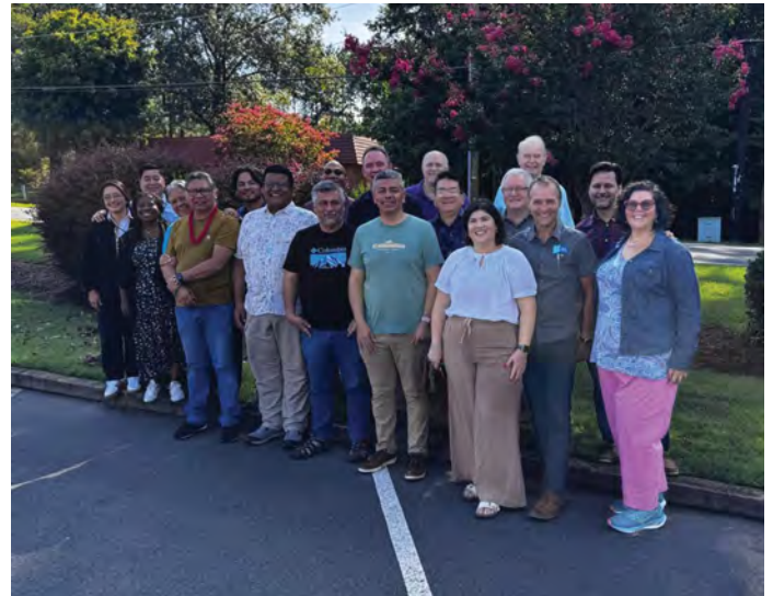
Members of the Latin American-wide Roundtable.

Historically, Wycliffe Global Alliance and SIL Area Directors in the Americas met to maintain a relationship of cordiality, fraternity, collaboration, and to exchange of information. The Alliance and SIL Americas Area Directors agreed to take a step to transform this historical dialogue space into a ‘third space’ for friendship and regional collaboration. This group of regional leaders from the Americas represents 13 Alliance organisations and partners including Seed Company, Faith Comes by Hearing, Wycliffe USA-Global Partnership, JAARS, COMIBAM, YWAM, Latin America Bible translation roadmap of Bible Societies, the Three Waves Movement, Biblica, Bible League, Ethnos360 (formerly New Tribes), and Jesus Film. They met last year as a roundtable to talk about understanding of where the group sees Bible translation movements going in Latin America; the practice of polyphony in the movements; the Bible Translation Congress to be held in 2026; training in Bible translation and Scripture engagement roles;