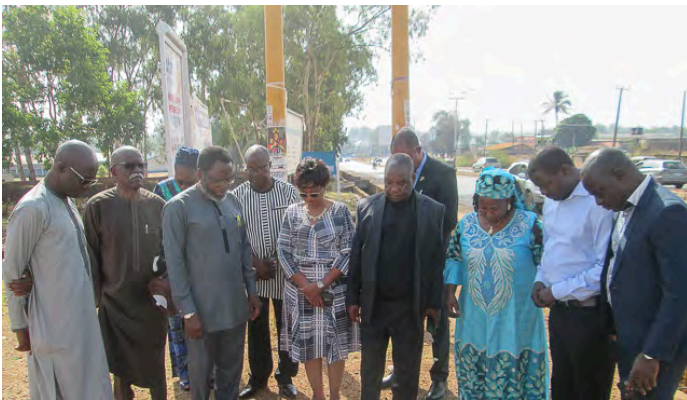
NBTT Board and Africa Area Director during prayer walk preceding board training