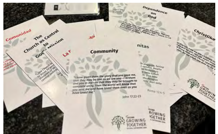
On each day of the Global Gathering, cards displayed individual values of the Alliance.

We are bound together by our Alliance Vision statement that we desire to see individuals, communities and nations transformed through God’s love and Word in their languages and cultures. We nuance this vision with our Alliance values. Each day of the Global Gathering focused on a separate value.