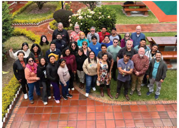
Participants in the course, Language and Translation in the Mission of God.

LTMG course with 40 leaders of the Assembly of God (Brazil).