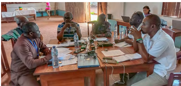
Participants in a discussion session during the project management training held in Gemena, DRC.