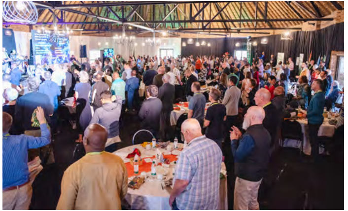
The congregation worships together.