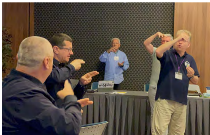
Leaders from the Romanian Sign Language team lead participants in signing a song.

In June, European Alliance organisations, together with other partners, convened in Bucharest to explore how best to serve the Deaf and Roma communities in our countries. The gathering focused on understanding their unique needs and finding ways to translate the Bible into their languages. This initiative has already led to translation work beginning or being planned in several countries, and we thank God for the growing passion and love for these often overlooked groups.