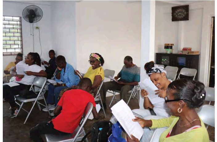
Oral Bible translation participants.