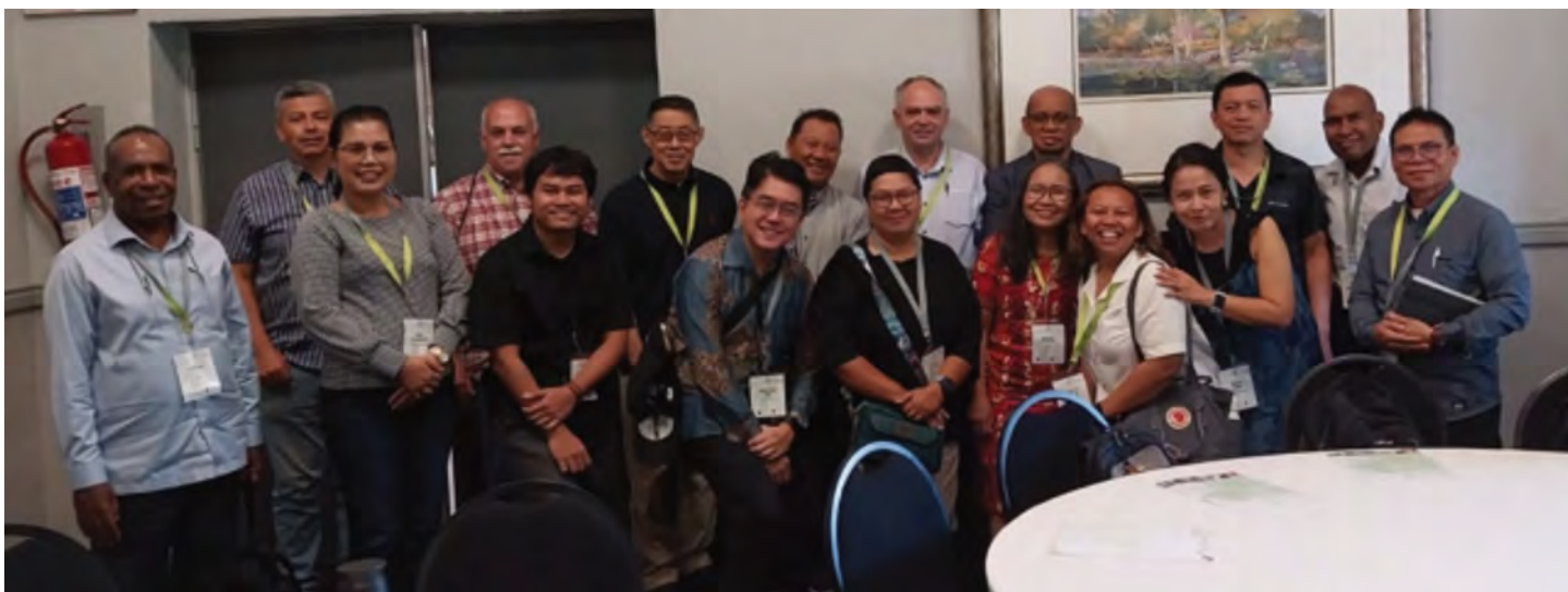
Indonesian delegates with interpreters and a few ALT members. They arrived in Jakarta the day before flying off, not knowing if they would get their visas.