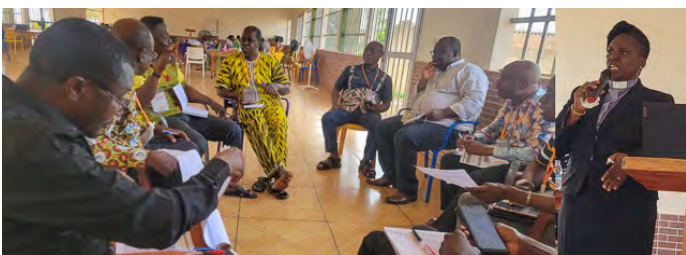
Francophone Initiative seminar in Jacquesville, Cote D'Ivoire, December 2024

Training of professors from Cote d'Ivoire theological institutions took place 24-28 November at Jacquesville, a small town located about 100 kilometres from Abidjan, the capital city. The course book La Traduction de la Bible et l'Eglise: Enjeux et défis pour l'Afrique Francophone (Bible Translation and the Church: Issues and Challenges for