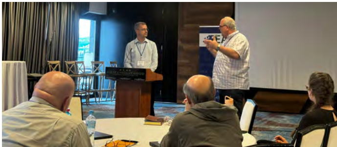
At the European Evangelical Alliance's General Assembly, Wycliffe Global Alliance was officially welcomed.

Evangelical Alliances across Europe and engaging in discussions about Bible translation needs both locally and globally.