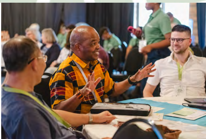
Table groups working on the key points of their reflection.

Throughout the gathering, moments of worship, prayer and reflection set the tone and resonated deeply with attendees. Pastor